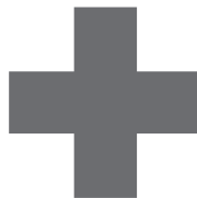
Canadian Red Cross Croix-rouge canadienne

As a member of this dynamic team, you will ensure workers are well trained, aware of their specific responsibilities and available for immediate deployment. You will be responsible for strategic decisions about the best methods of serving clients and providing a pertinent flow of information to those you supervise, as well as ensuring operational debriefings and evaluations occur after every response.